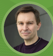
Dr. David Sinclair Co-Director, Paul F. Glenn Center at Harvard